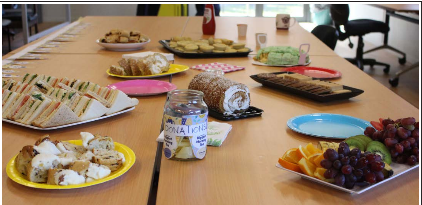
ULSC Staff at the Crookwell and Gunning Offices took part in Biggest Morning Teas on Wednesday 24 May in both Gunning and Crookwell, raising a combined $416 for Cancer Council Australia.

OneRoad and the Live Traffic NSW websites and apps are funded and maintained by Transport for NSW.