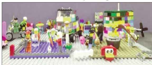
One of the impressive creations from Crookwell Library's Lego Club.

Join in the fun at Crookwell Library's Lego Club play sessions which encourage design, creativity, sharing and collaboration. Lego Club is a free program for ages 5 years and up.