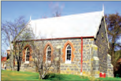
St Andrew's Presbyterian Church is one of the many stops on the Crookwell self-guided heritage walk.

Crookwell has a new self-guided heritage town walk which is a great way to see and discover the rich history of Crookwell through its natural features and historic buildings. The walk takes approximately one and a half hours and starts in Roberts Street alongside the Visitor Information Centre. Visitors to our region have already taken to walking the tree lined streets as the route takes the traveller around the historic structures, churches and picturesque parks giving a brief history on all points of interest. The walk is popular among both our day trippers and overnight guests. Many locals have also dropped in to the Information Centre to get their copy so they can learn more about their home town. Tourism staff and members of the historical society are currently in the process of working on a Gunning and Taralga town walk which will be completed shortly.