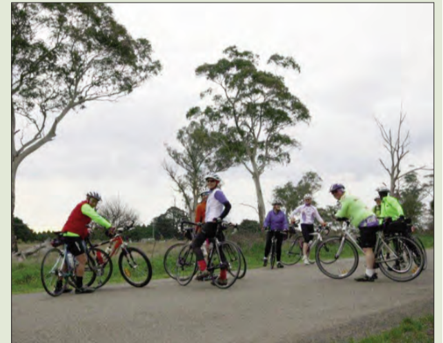
The Upper Lachlan Tourist Association will work with Cycle Life HQ to encourage cycle tourism to the Shire.

We look forward to working with Cycle Life HQ to not only develop a cycling tourism marketing campaign but also to identify new itineraries and curated rides. Part of the project will involve workshops for local businesses to better understand what bicycle tourists are looking for and to learn from best practice destinations. We will be encouraging as many local operators as possible to get involved and help position the Shire as a "must do" cycling experience.