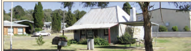
Gunning's Pye Cottage.

Upper Lachlan Shire Council has signed a Memorandum of Understanding (MoU) with the Gunning and District Historical Society, reaffirming Council's commitment to the ongoing operation of the Historical Society and support of local history.