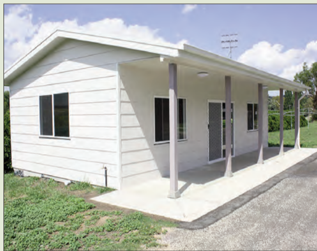
The fully equipped camp kitchen at Crookwell Caravan Park is a hit with visitors.

68% increase in the last five years alone. The caravanning and camping sector is booming. It's not just the grey nomads who are out and about, many visitors are young families who want to escape the hustle and bustle of the cities and enjoy some peace and quiet whilst on their holidays. The popularity of our park comes down to several factors including our clean facilities and fully equipped camp kitchen, which is well known in the caravanning circles via word of mouth and internet sites such as Wiki Camps. Campers love the close proximity to Crookwell township. Being able to walk into town to shop, grab a bite to eat or purchase necessities for their trip makes their trip all the more enjoyable.