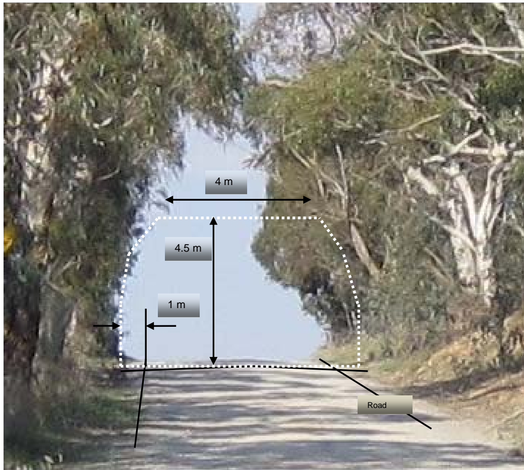
Diagram 1 – A Tree / vegetation clearance envelope